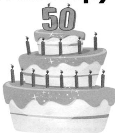
Fifty candles on the cake? It's time for your first colonoscopy.

The fix: You're limited to a clear-liquid diet for about 24 hours before the procedure, and may also have to drink up to a gallon of a laxative solution. To improve the solution's taste, chill it first, or ask your doctor whether it's OK to add lemon, lime, ginger, or a flavor enhancer like Crystal Light. Other steps that might help (bravely shared by readers who responded to a query on the Consumer Reports' Facebook page) include eating lighter than usual a day or two before your prep, using a straw to